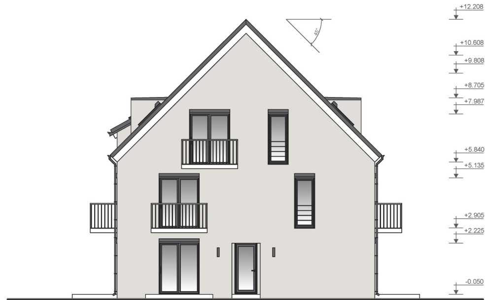
Fassade 1. 1:100 (A-3)